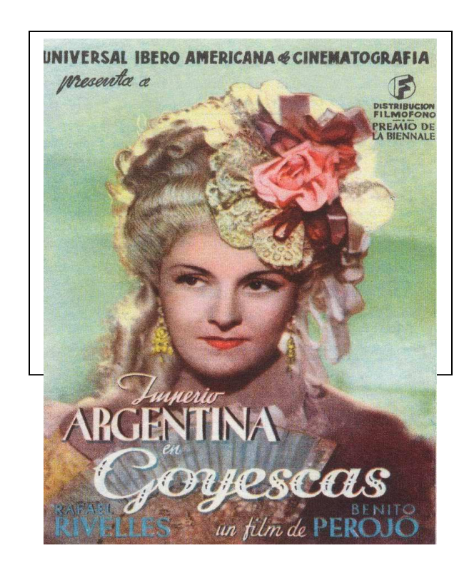
Film poster: Goyescas, by Benito Perojo 1942

In other words, neither Goya nor the War of Independence of 1808 was used in Spanish cinema of the early-1940s as anything more than vague elements within a historical and cultural background of dances, celebrations, and bullfights. It would be many years until the figure of Goya was restored in a positive light. Let us remember that one of Goya's few appearances as a character in Spanish film during these years was in El abanderado (Eusebio Fernández Ardavín, 1943), where as mentioned before, Goya appears as a drunken, womanizing Francophile. In the same way, once the cycle of the "Cine de Cruzada" ended, it would take several years before the War of Independence of 1808 would be used as a theme in Spanish national cinema. This would give rise to the production of films beginning in the mid-1940s such as El verdugo (Enrique Gómez, 1948), El tambor de Bruch (Ignacio F. Iquino, 1948),