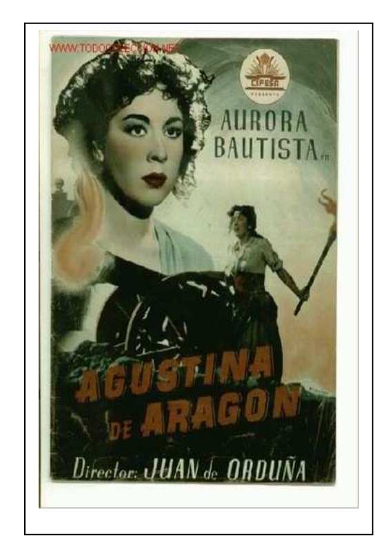
Film poster: Agustina de Aragón, by Juan de Orduña 1950

In this second stage then, the War of Independence not only converted into a frequent theme in Spanish film, but films that did touch upon this subject matter received important recognition. For example, the most prestigious award, "of National Interest," was conferred on the films El tambor de Bruch and Agustina de Aragón . These two films exhibit an obvious pro-government undercurrent similar to the tableaux vivants aesthetic that defined historical films of the 1940s; they also present an overt defense of traditional Spanish values that opposed the foreign enemy threatening to dissolve national customs.