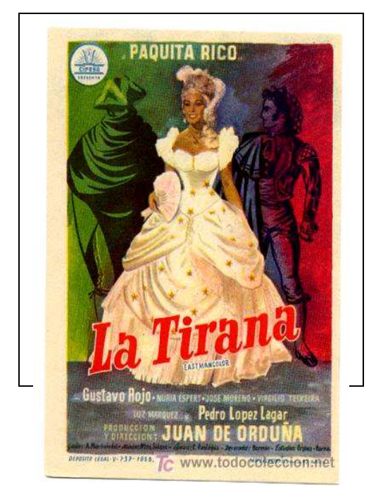
Film poster: La Tirana by Juan de Orduña 1958.

Among the above-mentioned names and titles, Goya, una vida apasionada (José Ochoa, 1957) would stand out. Despite its production by a private entity, it is the closest to an official project by the regime that could be found in the late 50s, nearing the date of the 150-year anniversary of the War of Independence of 1808. This film actually received a number of significant awards in Spanish cinema -for example, the award for the best documentary in the Premios a la Cinematografía Nacional, organized by the Sindicato Nacional del Espectáculo, and in the Premios del Círculo de Escritores Cinematográfico-. At the same time, the film was selected to participate in international competitions such as Cannes. And, of course, the film obtained the official rating of "interés nacional," something extremely unusual for a short film of this type.